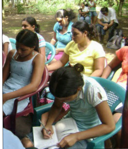
Due to the enthusiasm and perseverance of a group of 5th and 6th graders , a reading group was formed in Goyena for students who were too old for the 1st-4th grade after school program. The group of 15 students meets a couple times a week to read together and were all very proud at having recently finished the first complete novel they had ever read.