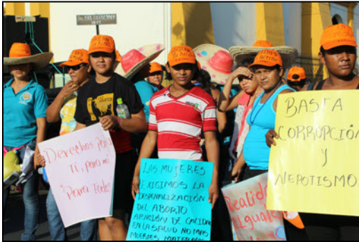
Women's march in Leon on the International Day for the Elimination of Violence Against Women.

In the nearby community of Troilo we have a difficult and sad case. "When her husband leaves for work each day he leaves them locked at home," says a women's rights promoter. "The 22 year old woman remains in a 12x12 foot room along with their four children waiting for the