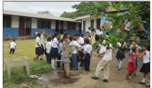
Primary students gather at well outside Goyena school buildings.