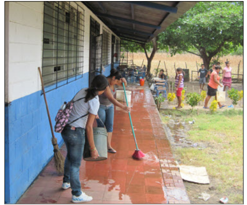
Parents, teachers, and students clean the primary school before classes start in February.