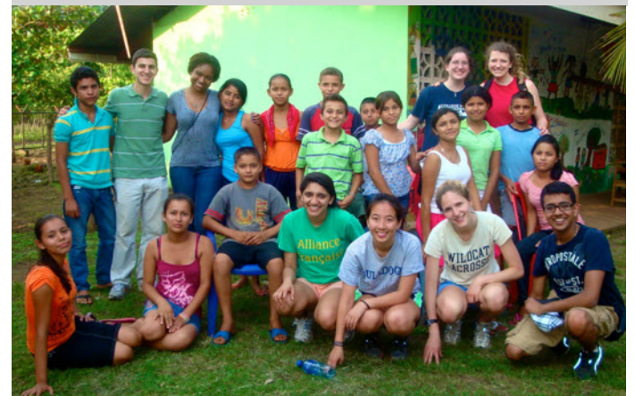
Yale delegates with members of the Youth Brigade outside preschool.

León mural above left depicts attack on protesting students in 1956 by the National Guard during the Somoza dictatorship.