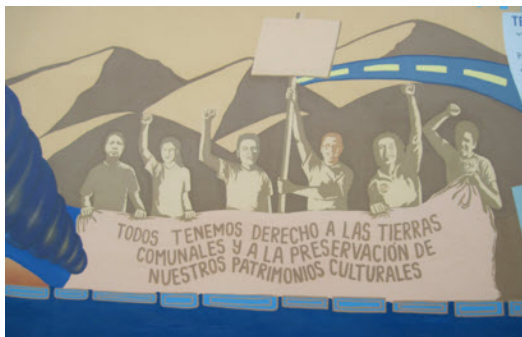
Mural in Sutiava (León), Nicaragua... "All have the right to communal land and the preservation of our cultural heritage."

Presorted Nonprofit org. U.S. Postage PAID Permit No. 726 New Haven, CT