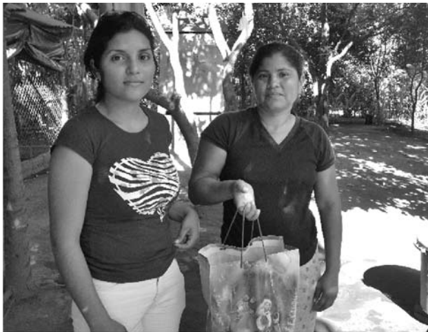
Leaders from the neighborhood of Nueva Vida

The Board, with staff from New Haven and Leon, committed to emphasize community organization and participation in any and all endeavors undertaken by the Project. The NHSCP is interested in nurturing efforts that respond to specific needs identified by Nicaraguans, that build existing local leadership, and that improve long term capacity to challenge systemic barriers to better quality of life.