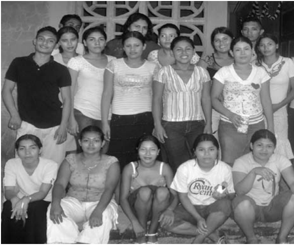
A group of youth from the community of Goyena who participated in workshops on violence, self-esteem, and sexuality.