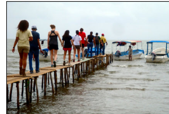
Yale delegates boarding launch for tour of Isla Juan Venado Nature Reserve.