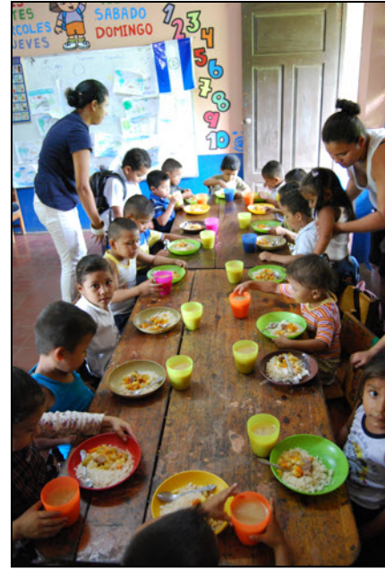
Lunch at preschool in Goyena.