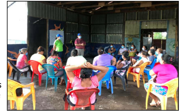
Photo: Meeting with Rotary Club official and Trolio women to discuss community needs.