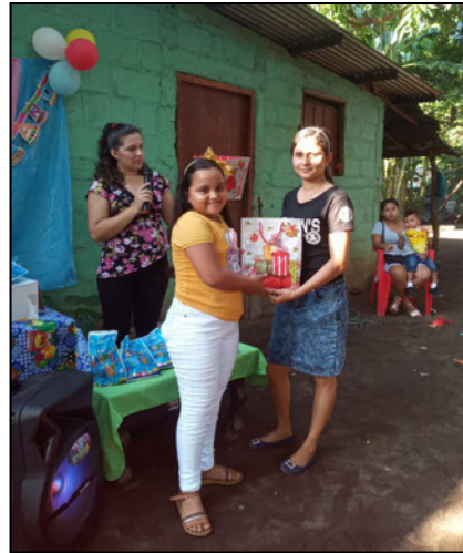
Photo: One of the periodic Afterschool joint birthday celebrations for students.