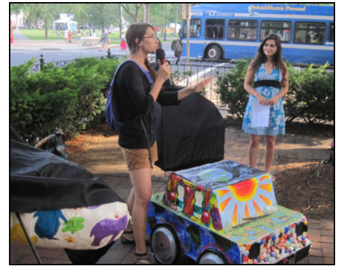
COWS, CARS, COAL, AND PLANES: THE FOUR DON'TS OF CLIMATE CHANGE